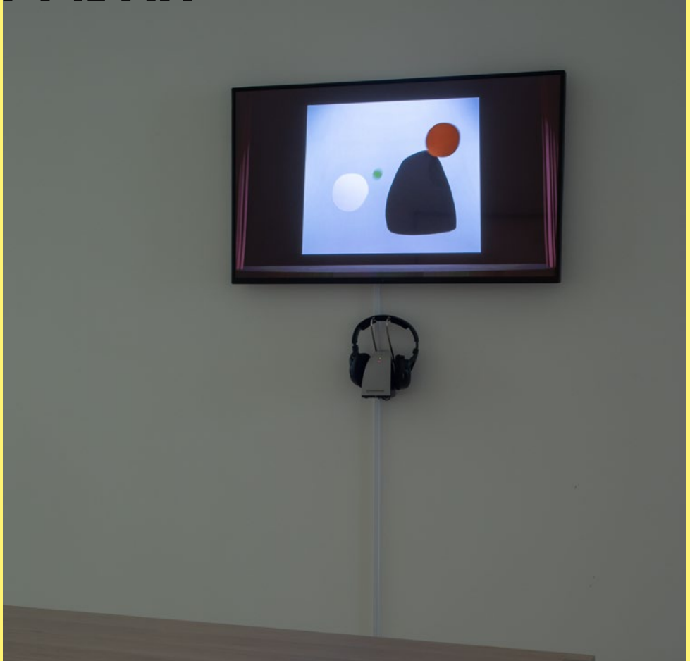
Inside Calder's head