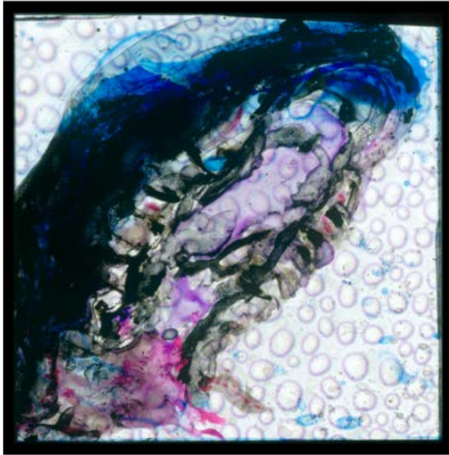
EDGAR CLEIJNE Y ELLEN GALLAGHER Osedax (diapositiva pintada a mano), 2010 © Edgar Cleijne y Ellen Gallagher Cortesía de los artistas y Hauser & Wirth